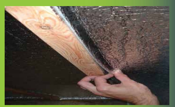
.....Staple To Inside Corner Of Joist

Save Energy. Save $$$. Do More. With Less. Period.