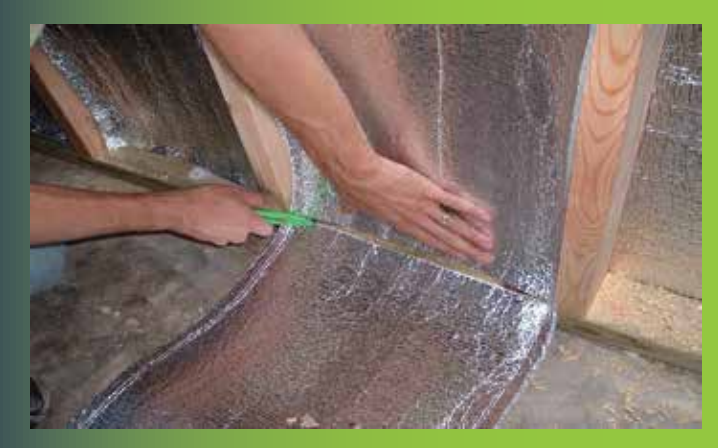
Cut To Length And....