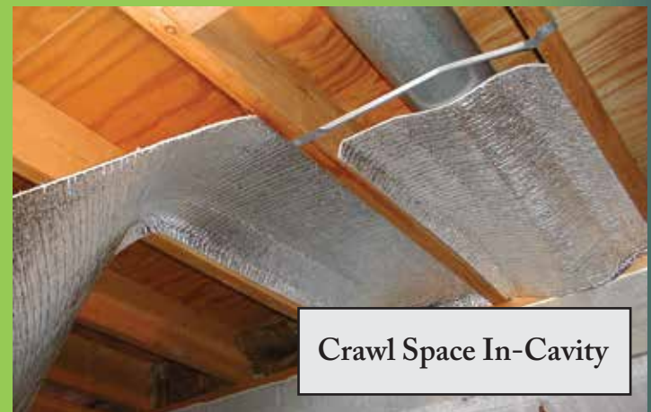
Crawl Space In-Cavity