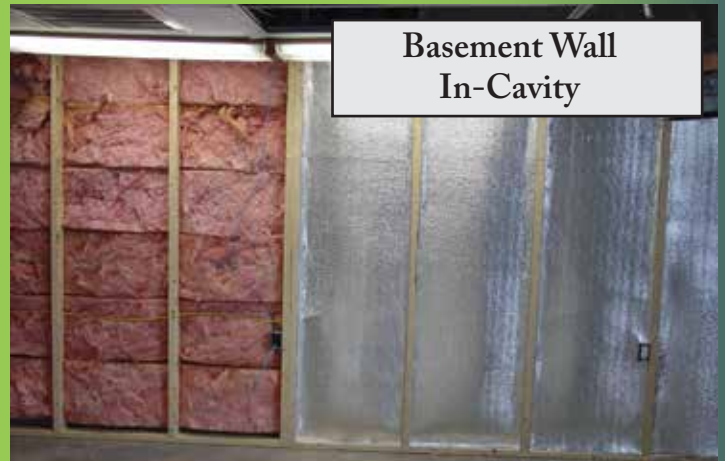
Basement Wall In-Cavity

High Quality Reflective Insulation For Everyday Use