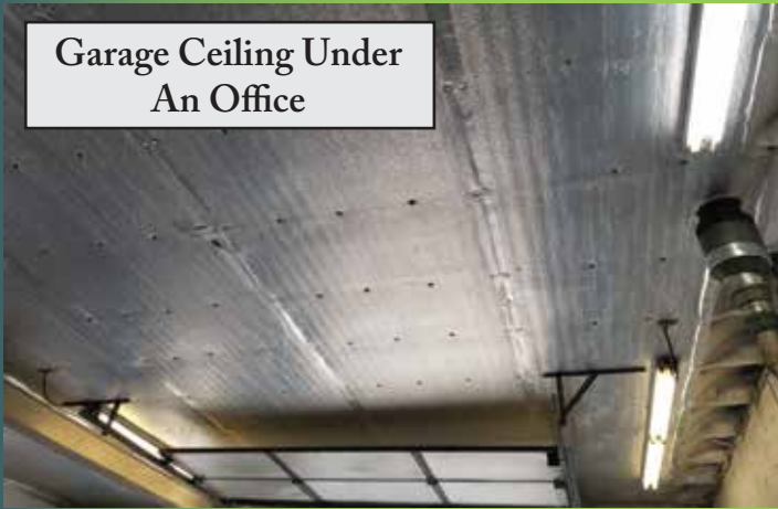
Garage Ceiling Under An Office