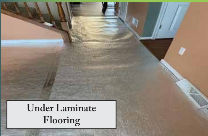
Under Laminate Flooring